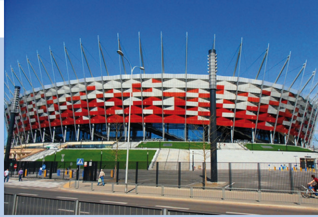
National Football Stadium